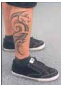
Rex Ryan added some body art during his vacation in Hawaii.