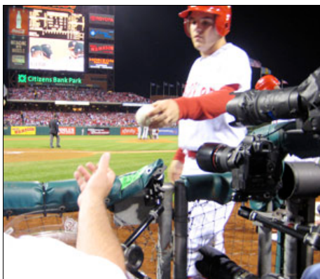
A Phillies bat boy gives a ball to an MLB authenticator during Game 2 of the NLCS.

The list of items which can be authenticated has no limit. Every baseball that remains in the field of play is documented. (Foul balls and home runs that go into the stands are kept by fans.) Broken bats, lineup cards,