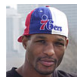
Bernard Hopkins Through The Years