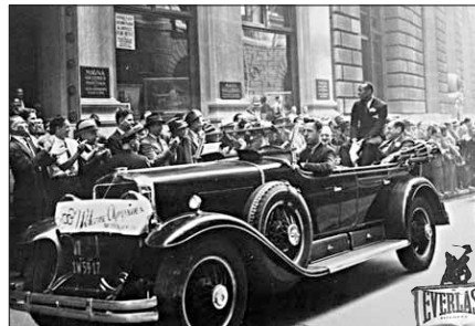
The Sports Museum of America's artifacts include a photograph from Jesse Owens' 1936 ticker-tape parade in Manhattan, above, and a boxing glove from Ali-Frazier II at Madison Square Garden in 1974, right.

"I thought we could build something in New York City that would be both its own museum of all sports and an endorsement to get people to visit the actual Basketball Hall of Fame," said