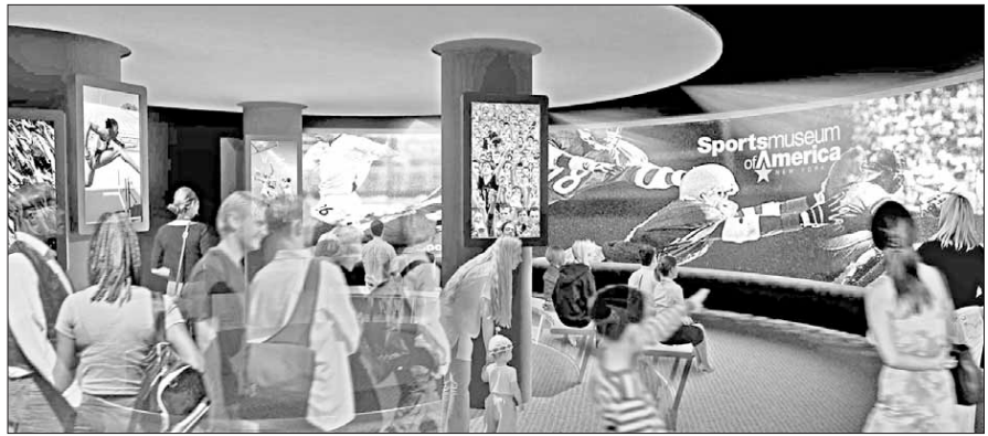
The Sports Museum of America opens on May 7. This is an artist's rendering of the planned Immersion Theater.

(212) 962-1000 (973) 473-2000 (302) 744-9800 (702) 364-2200 NEW YORK CITY, NY CLIFTON, NJ DOVER, DE LAS VEGAS, NV (800) 576-1100 (888) 336-8400 (888) 641-3800 (888) 530-4500 NY TOLL FREE NJ TOLL FREE DE TOLL FREE NV TOLL FREE 1 Maiden Lane, 5th Fl., NYC • 642 Broad St., Suite 2, Clifton, NJ 07013 • Preeti Kaushal, Managing Attorney