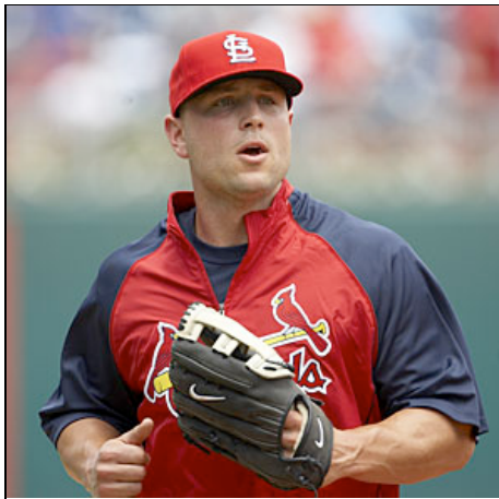
Matt Holliday's stats suffered at Oakland's McAfee Coliseum and should benefit from his new Busch Stadium home.

Those who were savvy enough to attempt a buy-low effort on Holliday prior to his trade have to be relieved