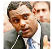
Infamous Drug-Related Incidents