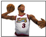
NBA Basketball 2000