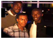
The NBA (Kinda) Solves the Economic Crisis