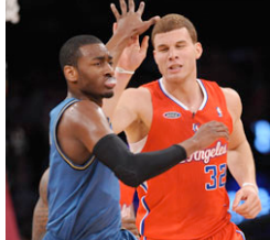
Video: John Wall Bounce Pass Oop To Blake Griffin