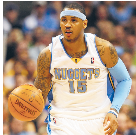
Denver's Carmelo Anthony, who averages 30 points, was expected to miss his third straight game last night.